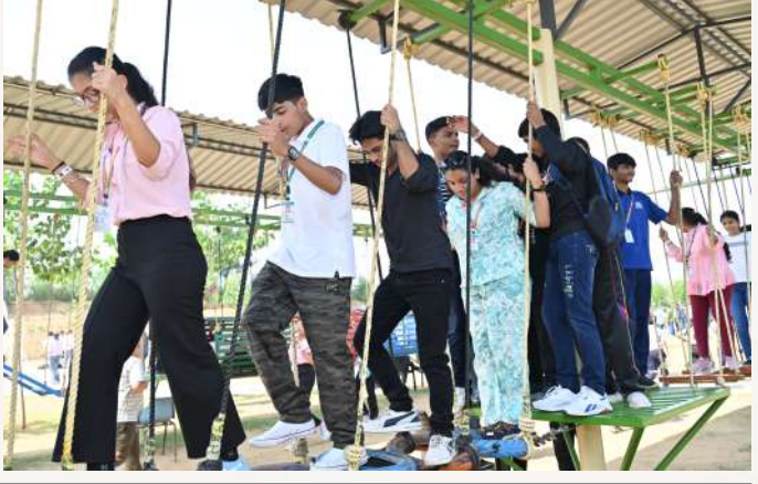
Rangmanch Farms, Gurugram